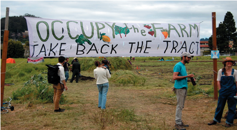
OCCUPY THE FARM gardeners agree that the University of California's effort to grow experimental corn without water is provocative, but eagerly look forward to seeing how well it works, no pun intended.