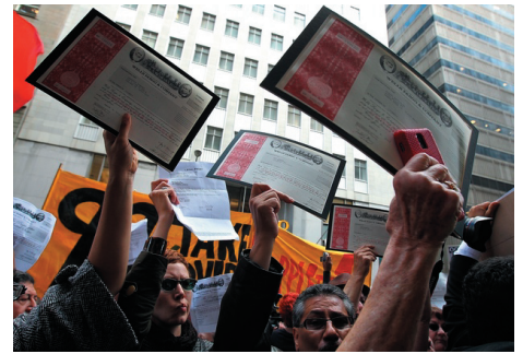
WELLS FARGO BANK had its shortest, liveliest shareholders’ meeting ever when a bunch of Occupy protesters bought shares and came to the meeting.